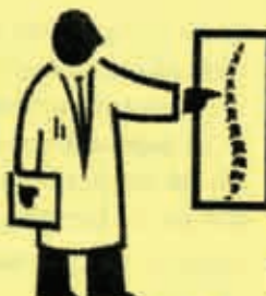
Phillips Bucky THE

We are asking you and your friends to help us raise enough funds for a universal x-ray machine for the main hospital in Mali Losinj . The hospital board appealed to our organization for a specific model approved by the